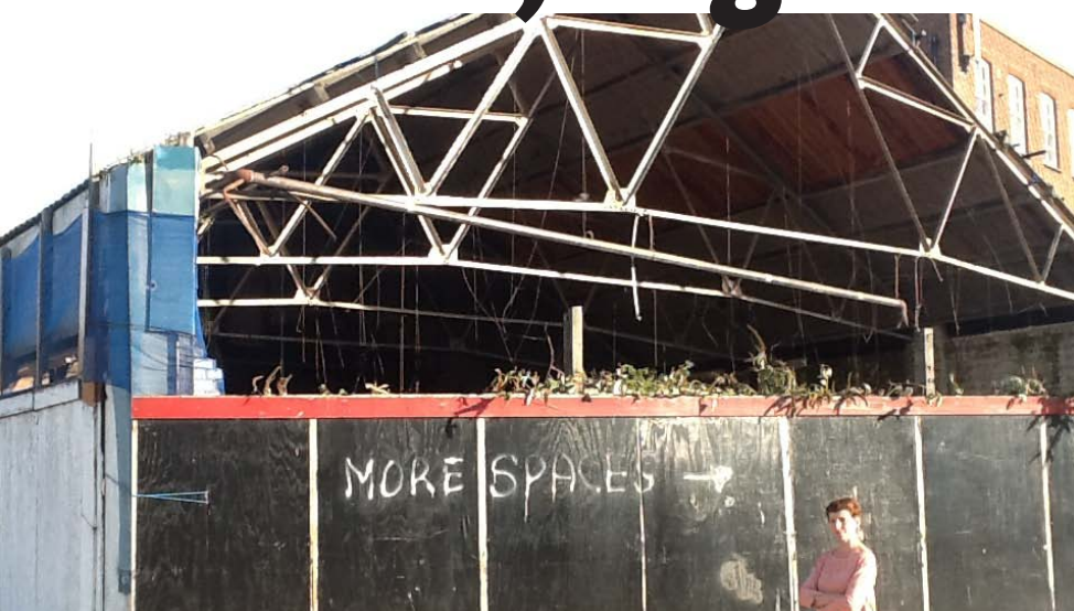
Brownfield development: this derelict site on The Broadway, Bedford, could be developed

Government policies are encouraging new development in the countryside, according to a report by the Campaign to Protect Rural England. The report found that the National Planning Policy Framework is “being used to impose unnecessary greenfield development in the teeth of local opposition” and that “brownfield sites are being overlooked in favour of building on green fields that are easier for developers”.