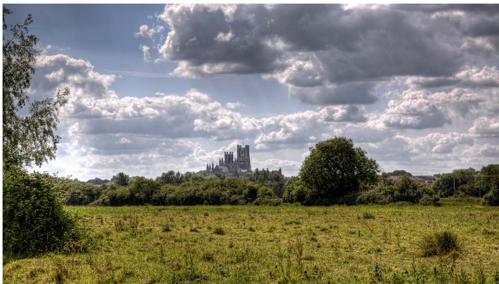
Greens want to conserve East Anglia's countryside, including these open fields near Ely.

At present 80% of CAP subsidies go to the largest 20% of farms. The reforms will start to redress this balance but plans to shift more